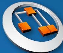
BUSINESS PROCESS MANAGEMENT

Through our public open-enrollment classes, private on-site training courses, virtual classes, mentoring, CBAP®/CCBA™ and PMP® preparation products, and other related resources, we provide individuals and corporations with the knowledge and skills they need to succeed.